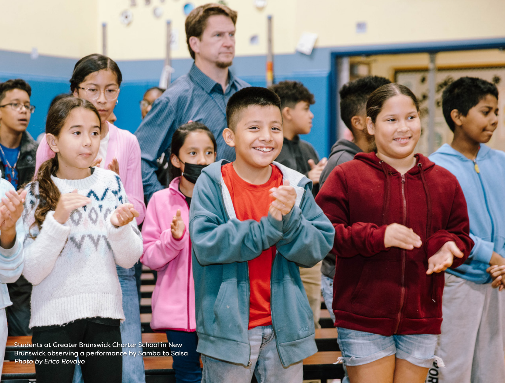
Students at Greater Brunswick Charter School in New Brunswick observing a performance by Samba to Salsa