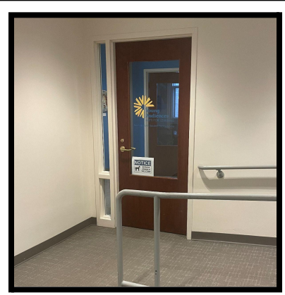
Coming from the stairs