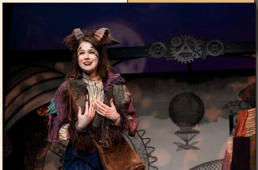
Puck in the 2021 touring production of A Midsummer Night's Dream.

The story of Pyramus and Thisbe is found in Ovid's Metamorphoses , and its plot is strikingly similar to that of another Shakespeare play written around the same time as Midsummer — Romeo & Juliet .