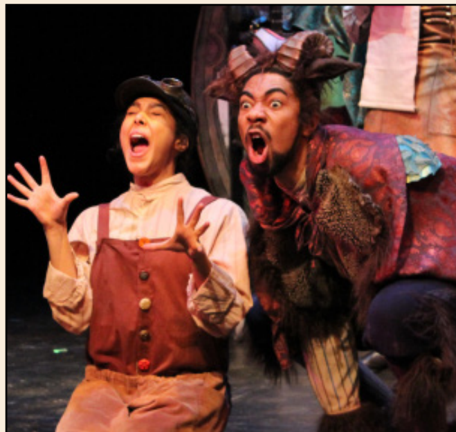
Puck and Snug from the 2019 touring production of A Midsummer Night's Dream.

5. Transformation is a major theme in this play. How are the characters transformed from the beginning to the end? Does the situation at the end of the play represent a new and improved reality, or are these transformations only skin deep?