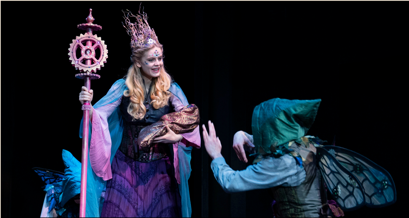
Titania and the Fairies in the 2021 touring production of A Midsummer Night's Dream.