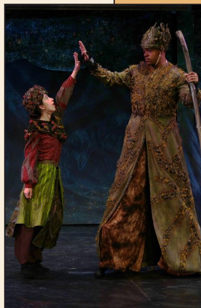
Puck and Oberon in the 2025 touring production of A Midsummer Night's Dream.

Isaac Asimov notes that "there is a folk belief that extreme heat is a cause of madness (hence the phrase 'midsummer madness') and this is not entirely a fable. The higher the sun and the longer it beats down, the more likely one is to get sunstroke, and mild attacks of sunstroke could be conducive to all sorts of hallucinatory experiences. Midsummer, then, is the time when people are most apt to imagine fantastic experiences."