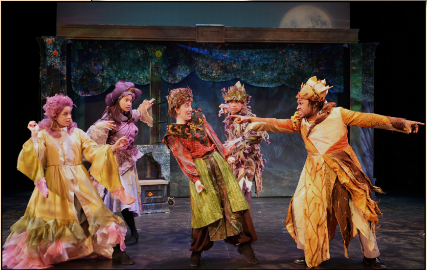
Puck and the Fairies from the 2025 touring production of A Midsummer Night's Dream .

The names of the Mechanicals mostly reflect their occupations. Bottom, the weaver, is named for a skein of yarn or thread, called a "bottom." The name of Quince, the carpenter, suggests "quines," or blocks of wood used by carpenters in building. Flute is a bellows mender-- the bellows has a fluted shape, and was used to compress air to stoke a fire or to produce sound (as in a church organ). Snout, the tinker, would have been a mender of pots, pans and kettles-- the spout of a kettle was often called a "snout" in Shakespeare's time. Snug is a joiner, one who manufactures cabinets and other jointed furniture made of snug-fitting pieces of wood. Finally, in Shakespeare's time, tailors were usually depicted as abjectly poor and thus, rail-thin from hunger— in other words, "starvelings."