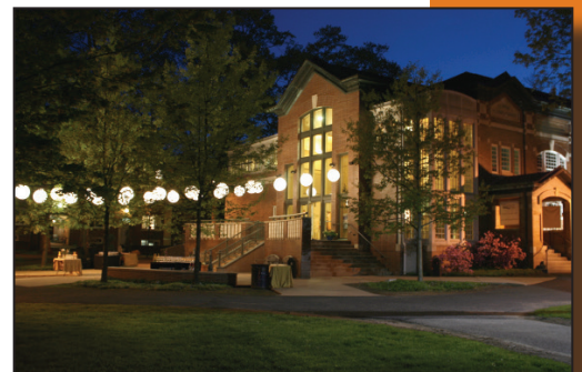
The F.M. Kirby Shakespeare Theatre