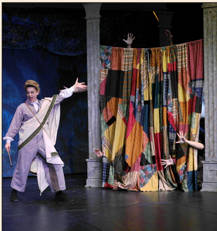
Peter Quince and the Mechanicals from the 2025 touring production of A Midsummer Night's Dream , Photo by Brian B. Crowe.

Write a letter or diary entry from the point of view of one of the characters, discussing an event or situation in the play. For example, love letters between the couples, a letter from Egeus