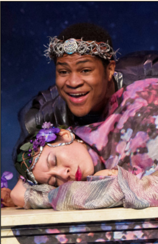
Oberon and Titania in the 2015 touring production of A Midsummer Night's Dream .